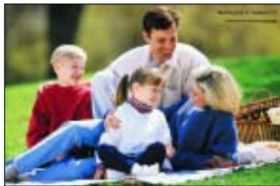
Teaching Aid 3

After the children have identified who is in the picture, point to a specific figure, such as the man. Who is this? (Father) What kinds of things does a father do? (The children may give a variety of answers including work, stay at home, mow the lawn, wash dishes, play, etc. Be aware that some