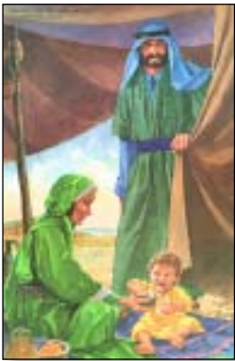
Teaching Aid 2

The children should still be gathered in a group ready for the story. Have your Bible open to 1 Samuel 1 to begin. Today's story comes from the Bible. It is found in the book, or part, of the Bible called 1 Samuel. (Show the children where 1 Samuel is in your Bible. Keep your Bible open to 1 Samuel 1 as you tell the story.)