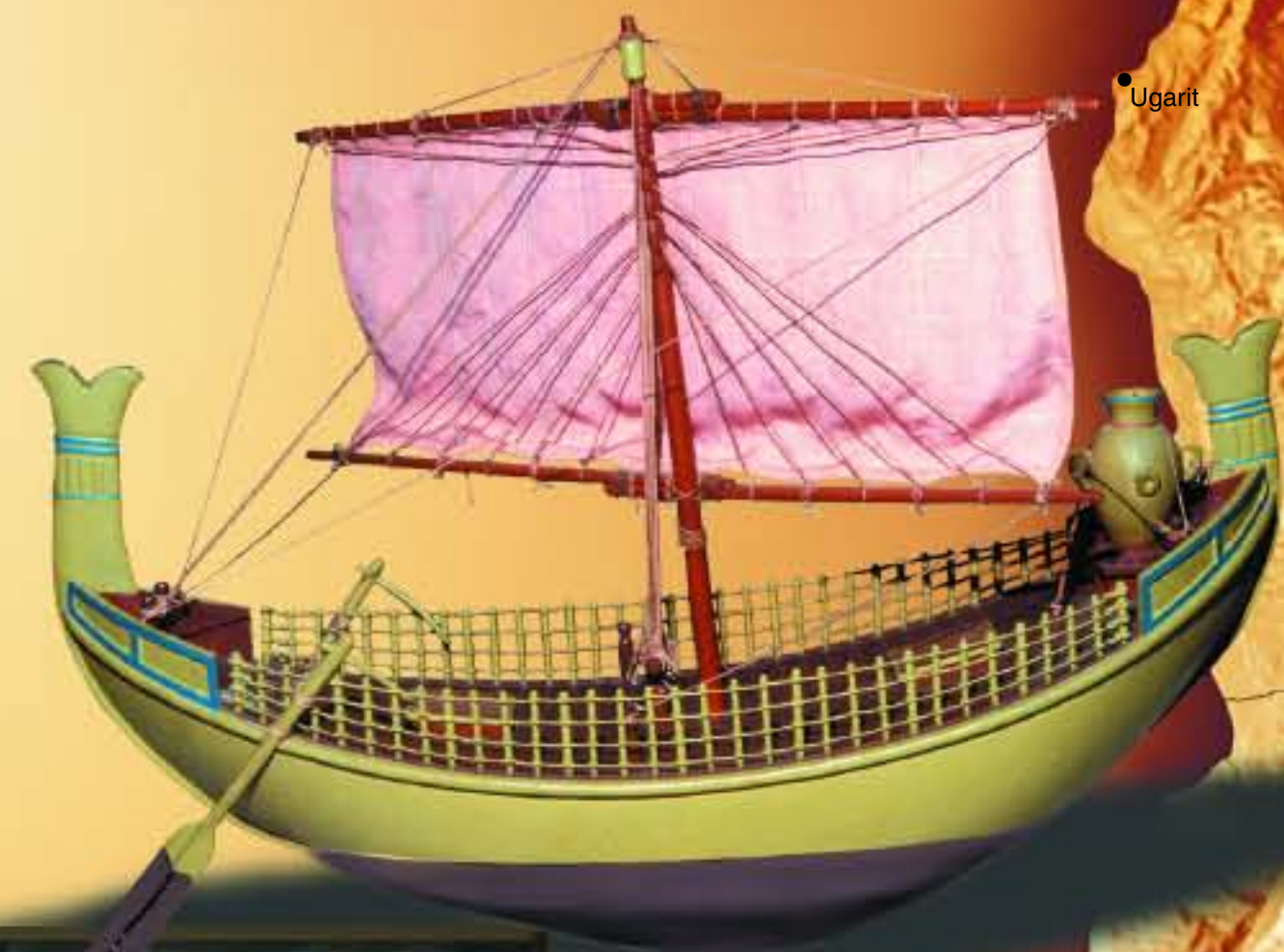
ABOVE: A model of a ship from the time of Solomon. He created the first Israelite trading fleet, with the help of sailors from King Hiram of Tyre. The fleet brought gold from the mines of Ophir, ivory, and even exotic animals back to Solomon (1 Kings 9:26-28; 10:22).