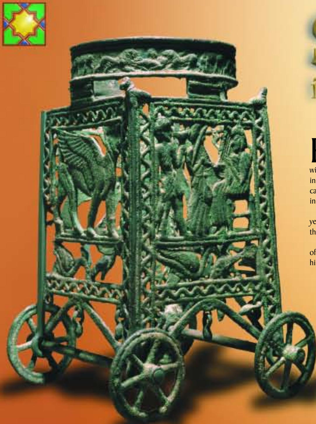
ABOVE: This movable bronze basin on four wheels has been dated to about the eleventh century B.C. and was found on the island of Cyprus. It resembles the 10 basins that Solomon made for the temple (1 Kings 7:27-37).

Behind the prosperity, however, were signs of the kingdom's corruption. Solomon married the daughters of the pagan rulers around him and then built temples for his wives to worship their gods. When Solomon himself joined in their idolatrous worship, God's judgment came upon that glorious kingdom (11:7-13).