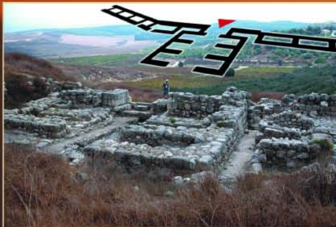
BELOW: The remains of a triple gate at the site of the ancient city of Gezer, one of the cities Solomon fortified along his border with the Philistines (1 Kings 9:17). The foundations of similar gates, with two outer towers and six flanking guardrooms, have been found in two other cities Solomon rebuilt: Megiddo and Hazor (vs. 15).