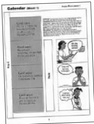
"Calendar" Kid Crafts Lesson 1

Distribute the Elementary Kid Crafts project for Lesson 1, Sheets 1 and 2. Help the children remove the border, open the die-cut lines, fold the flaps, and glue the two sheets together in the center according to the printed instructions. Help students tape or staple the flaps at the top and bottom. If you wish, punch holes in the top corners of the calendar and tie on a string hanger.