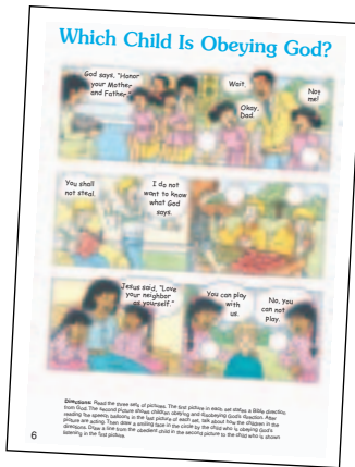
My Bible Book, p. 6

Samuel was a good listener, wasn't he? And he did what he was told, didn't he? Do you think being a good listener has anything to do with obeying? Have students turn to page 6 of My Bible Book . To discuss the top set of pictures, point to the first picture. Ask for a volunteer to read the speech balloon and to describe what is happening in this picture. (The teacher is reading one of God's rules to the Sunday school class. Some of the children are talking instead of listening.)