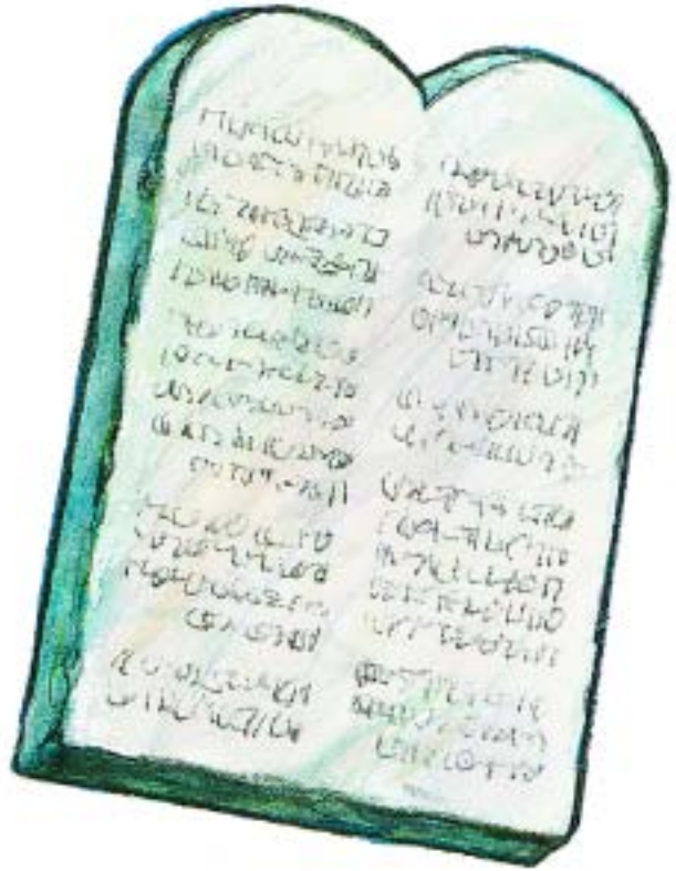
Project 7 Stone tablet for page 18

PROJECT 13: Preeta puppet. Cut out box and glue it on the back of the paper bag.